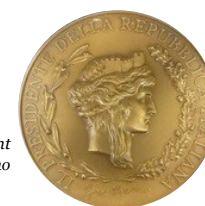
Right: Medal received from the President of the Italian Republic Giorgio Napolitano celebrating the Infopoverty Programme