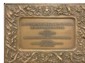
Left: Plate received from the President of the Italian Republic Sergio Mattarella celebrating the XVIII Infopoverty