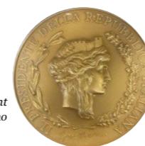
Right: Medal received from the President of the Italian Republic Giorgio Napolitano celebrating the Infopoverty Programme