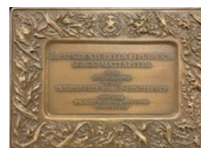
Left: Plate received from the President of the Italian Republic Sergio Mattarella celebrating the XVIII Infopoverty